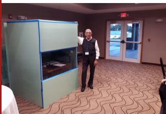
Hut used for translating